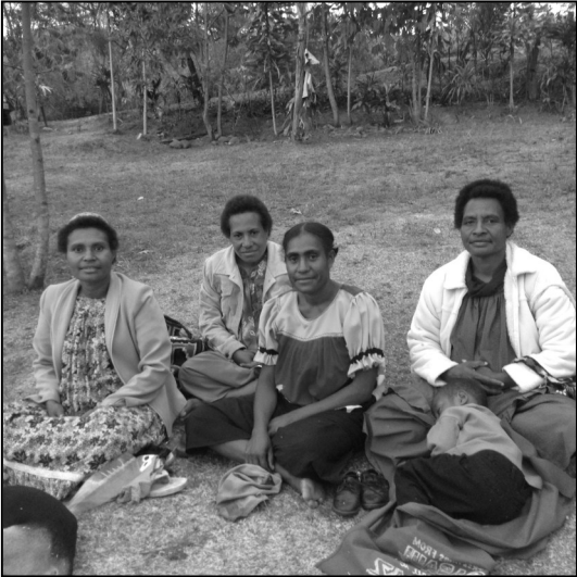
E.H.P Medical Ministry Workers

Hello and greetings to you all in the Name of Our Lord Jesus Christ, Amen! Gospel workers and Medical Missionaries here in Goroka, EHP, are able to work together to give instruction in the principles of healthful living. There is sickness everywhere, and most of it might be prevented by attention to the Law of Health. We (people) need to see the bearing of health principles upon our well-being, both of this life and for the life to come. We need to be awakened to our responsibility for the human habitation fitted up by our Crea-