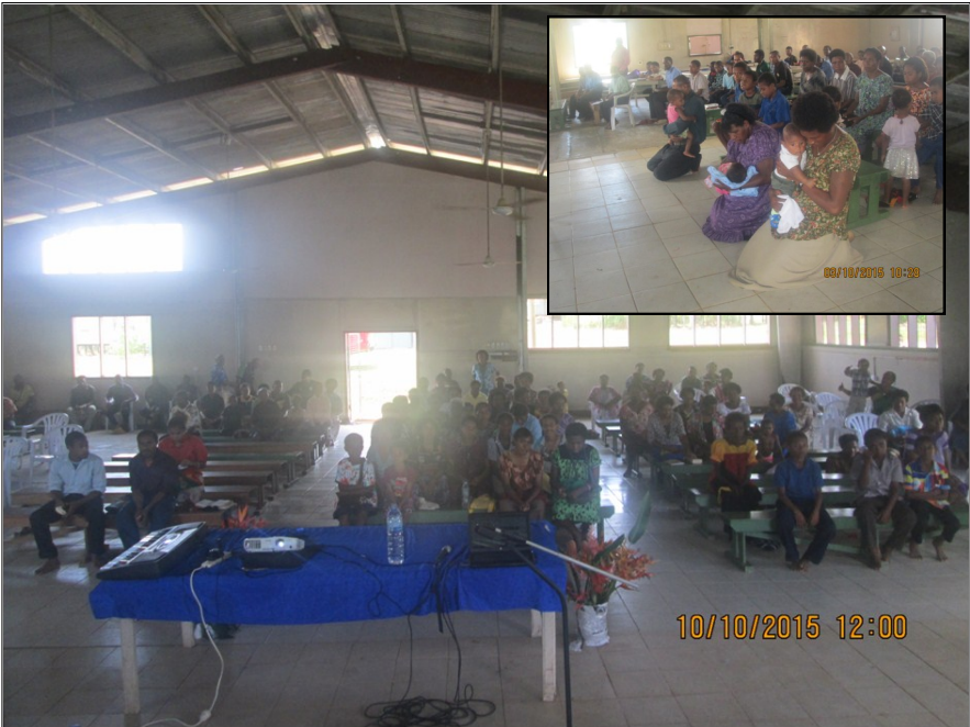
Congregation getting ready for Sabbath worship at the rental worship centre in Kiunga.

Kiunga church finally call themselves the Repairers of the Breach and join the thousands that declare before them to repair and restore the TRUTH.