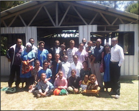
Part of Komum congregation in front of their church