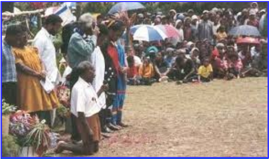
Gathering of people on the State appointed day of Repentance—August 26

There is a saying that says, ‘you are what you eat’. Certainly science has more than proven it—it emphasize it. But how true it is for those who eat at the table of Caesar. Whether they have done it secretly or openly, one way or the other, the true intention of their hearts have been brought forth for all to see and certainly Jezebel has succeeded in her effort in bringing the prophets of God to the table of her Emperor. See what happened? All the intents of Caesar are now manifest by the actions of the prophets at his table.