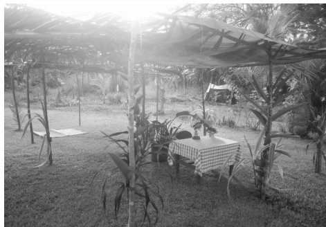
A shelter for a first Sabbath in Popondetta

A land was provided and a shelter was erected — all in a week's work. The Sabbath day of the twenty seventh day of the six month of the Gregorian calendar was a special one for a group of twenty people. For some it was their first time observing a Sabbath let alone knowing what Sabbath is. For a few families, it has been a long wait. A patient one indeed. Due to the compromise seen in the church, they have decided to move out and stayed home and have been observing Sabbath in their own homes.