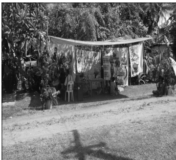
Gorouta Street preparing the banners for the night Teaching

It's a news in the news itself when a street testified and witnessed the Truth of God. Gorouta street along the Keroton Rd in Popondetta for the first time as far as the gospel workers who went to Popondetta were concerned have publically witnessed the Truth of God.