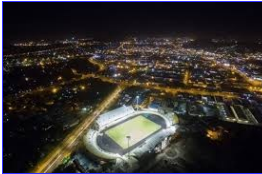
Port Moresby Night sky during the Pacific Games

The nation of PNG is at the bank of Jordan river ready to cross over. Are we to believe the report of the 10 spies and submit to the majority of the Christian Churches and pray for the games and to erroneously using scriptures to justify the support of abomi-