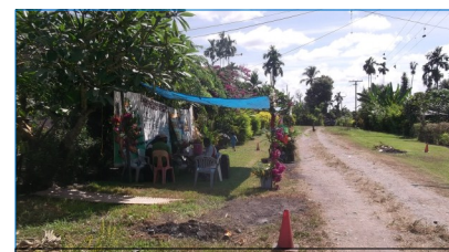
Gorouta Street in readiness for the night teaching where their residents plus residents of other streets came to participate in the one night event.

The whole street is now preparing to host a more detailed 5 nights teaching and will notify soon through the new church in Popondetta.